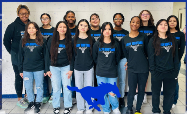
DEAN MUSTANGS 8TH GRADE B-TEAM GIRLS BASKETBALL

Our 8th grade Lady Mustangs were named this years undefeated zone champions!