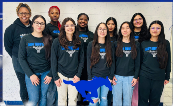
DEAN MUSTANGS 8TH GRADE A-TEAM GIRLS BASKETBALL